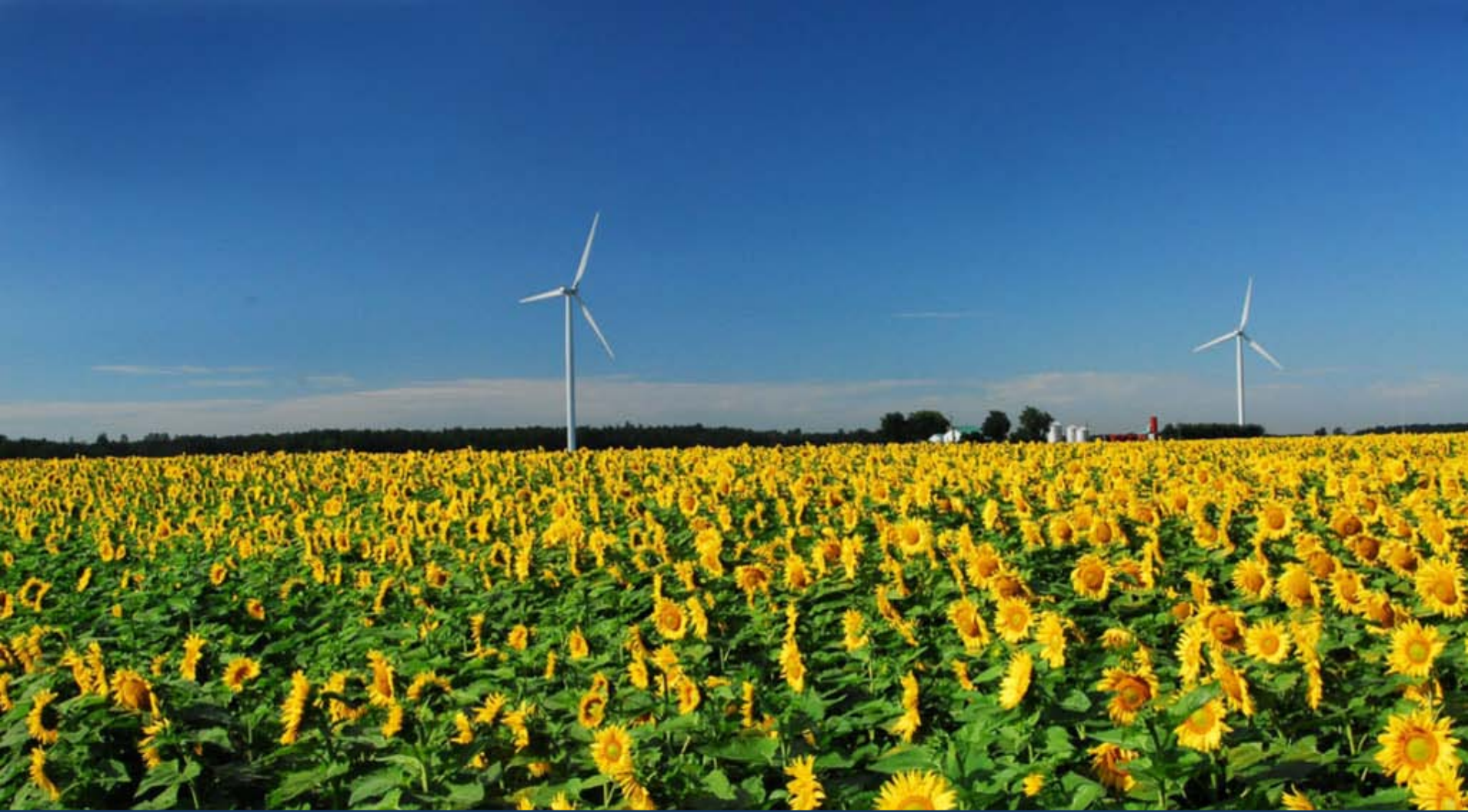
Sprott Power's Ravenswood, Ontario Project